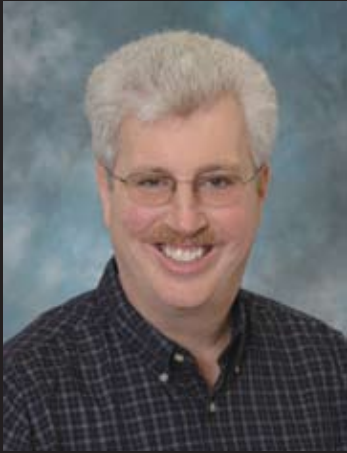
Assist Governor Pope