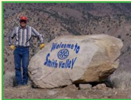
Not your ordinary Rotary sign: